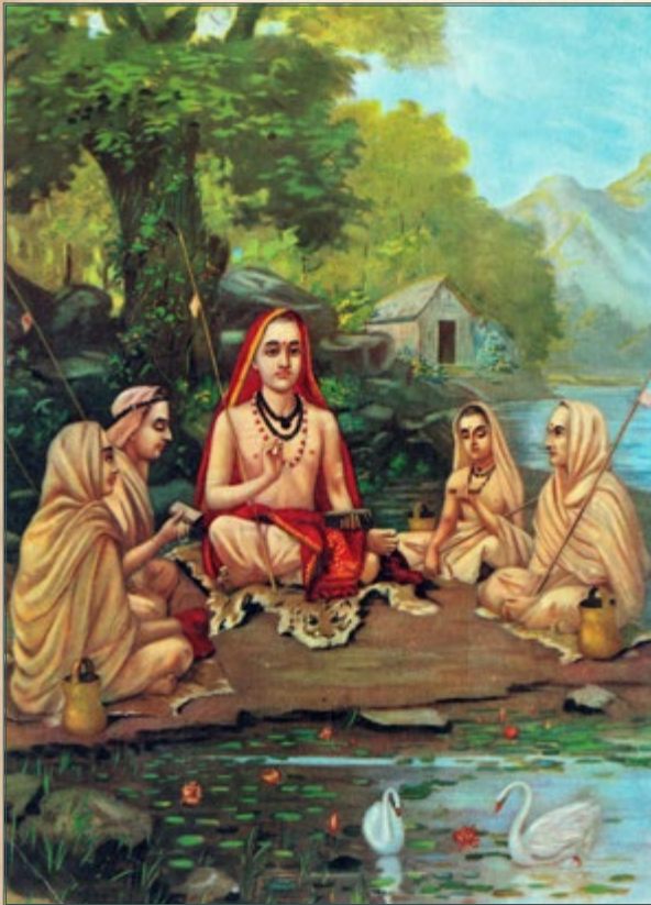
Adi Shankara with disciples, By Raja Ravi Varma

Aham Braham asmi I am Brahman Ayam atma Brahma This atma is Brahman Tat tvam asi Thou art that Sarvam All that is Brahman khalvidam Brahma