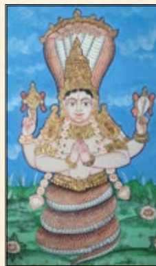
Classical representation of Patanjali, author of Yoga Sutras

Thus, Sankhya was the first Indian school of thought to prioritize the human faculty of reason to find answers to the metaphysical questions of life. It did not depend on a God to help find a way out of pain and suffering, nor to provide ready-made answers to the questions about the creation and destruction of the world. Therefore, in its origination, the classic Sankhya is considered by some to be atheistic.